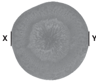
magnification \times 1

2 Fig 2.1 shows a section through the root of a carrot plant.